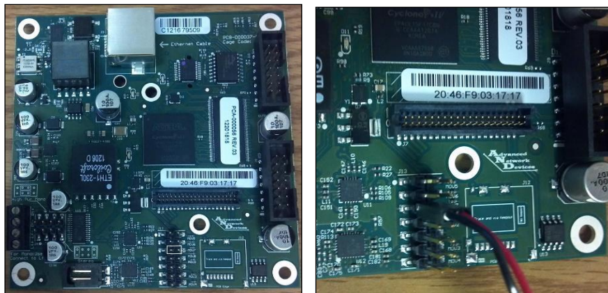
Connection to Controller Board

Plug the two-position .100" connector housing end of the cable onto pins 5 and 6 of the J13 header on the bottom edge of the square controller board in the device, as shown below. The black wire goes to pin 5 (ground), and the red wire to pin 6 (output 0, 3.1V).